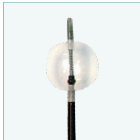
Syntel Thrombectomy Catheter