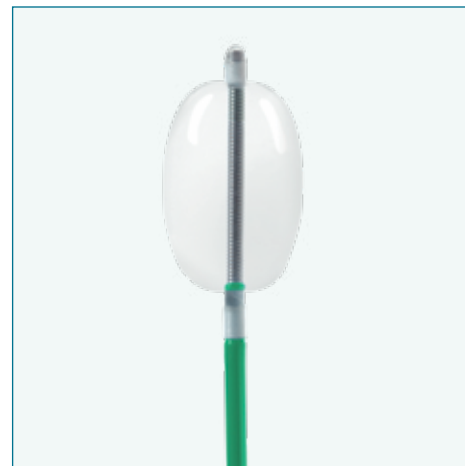
Syntel Embolectomy Catheter